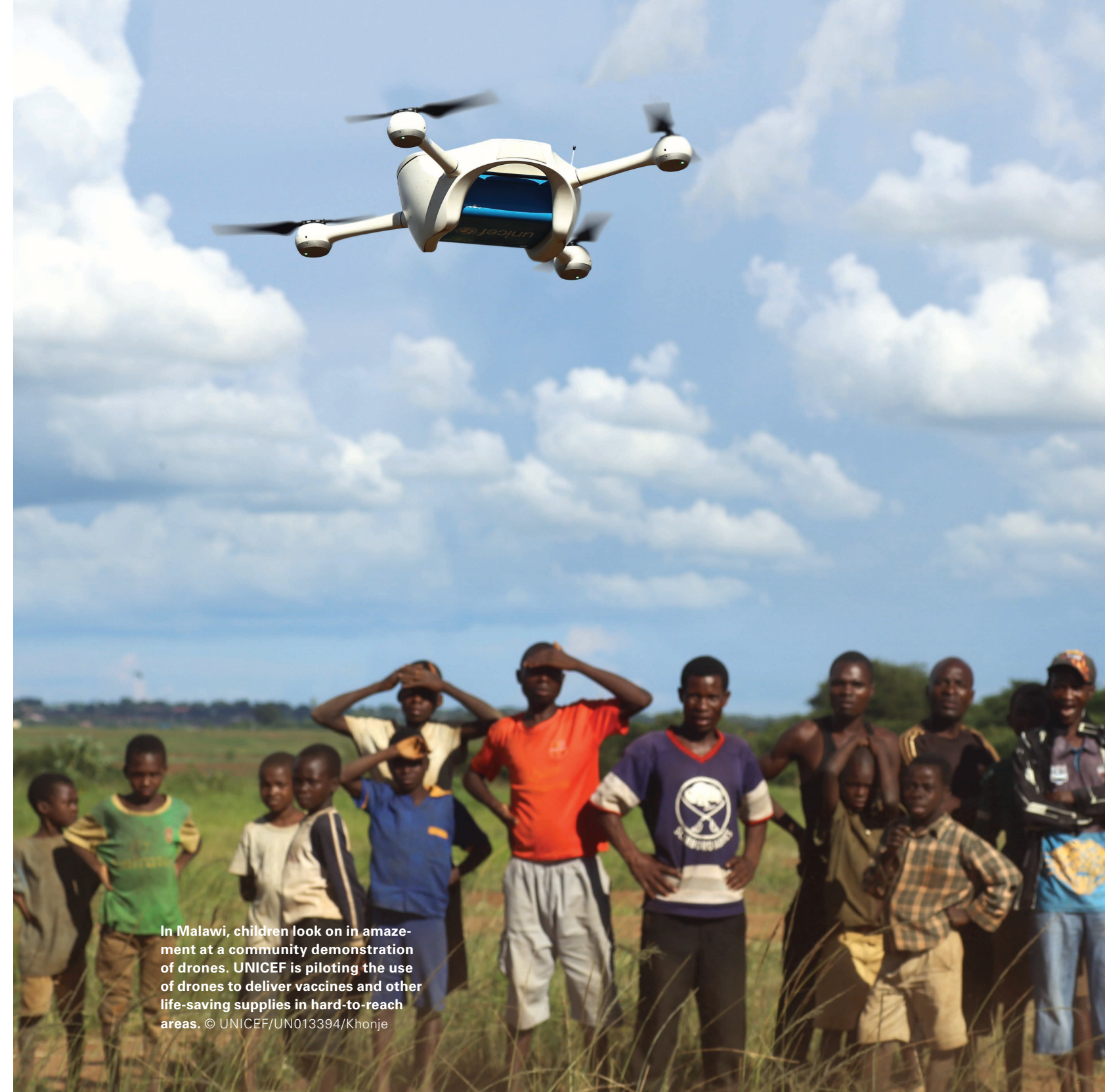
In Malawi, children look on in amazement at a community demonstration of drones. UNICEF is piloting the use of drones to deliver vaccines and other life-saving supplies in hard-to-reach areas.