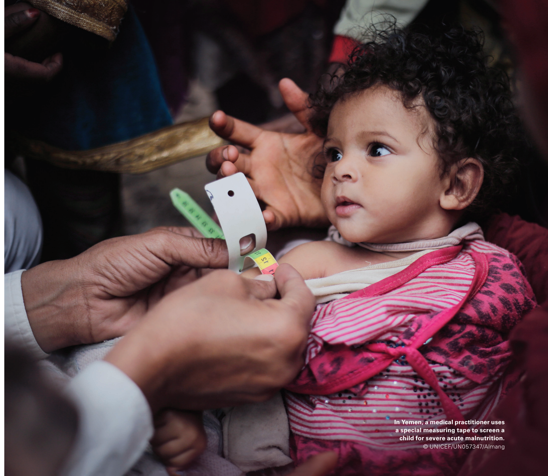
In Yemen, a medical practitioner uses a special measuring tape to screen a child for severe acute malnutrition.