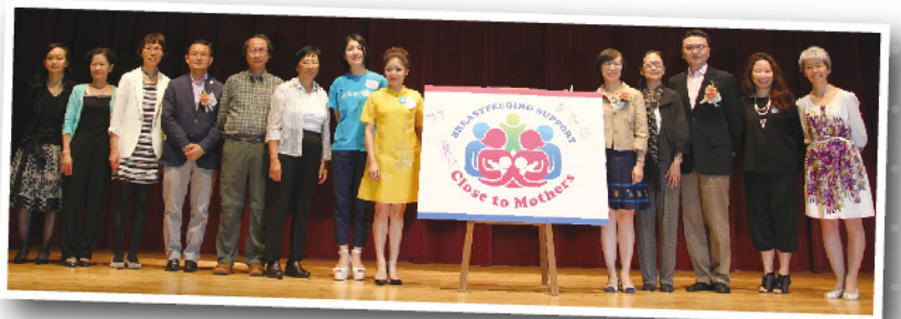
楊千嬅小姐與一眾嘉賓及委員合照 Ms Miriam Yeung together with VIPs and Committee Members.