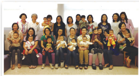
受訓完畢的學員在母嬰健康院內擔任母乳餵哺輔導員向新手媽媽「教路」，分享餵哺母乳心得

BFHIHKA together with the Department of Health, the Hospital Authority and Hong Kong Breastfeeding Mothers' Association published a comic book to promote breastfeeding. The booklet titled "Mum's milk factory" features lively interesting drawings with easy-to-read texts. Whether you have breastfed or not, you are sure to smile when reading it. Please visit our website www.babyfriendly.org.hk to download a copy (Chinese version only).