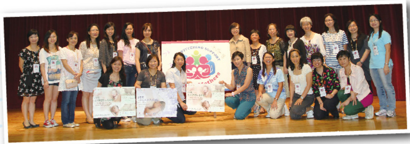
嘉賓與活動義工合照 VIPs and Volunteers