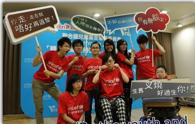
"By the youth and For the youth!"

The new series of VOY was launched on 1 July, 2011. Show your support to VOY and youth participation by logging on to VOY's website ( http://voy.unicef.org.hk ) every Friday from 7-8pm ! Online recap is also available in case you miss it!