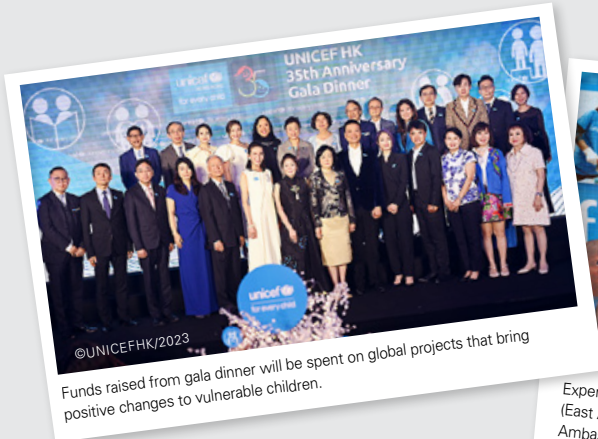
Funds raised from gala dinner will be spent on global projects that bring positive changes to vulnerable children.