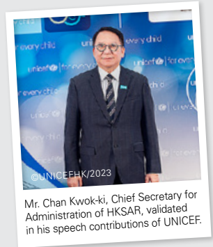
Mr. Chan Kwok-ki, Chief Secretary for Administration of HKSAR, validated in his speech contributions of UNICEF.