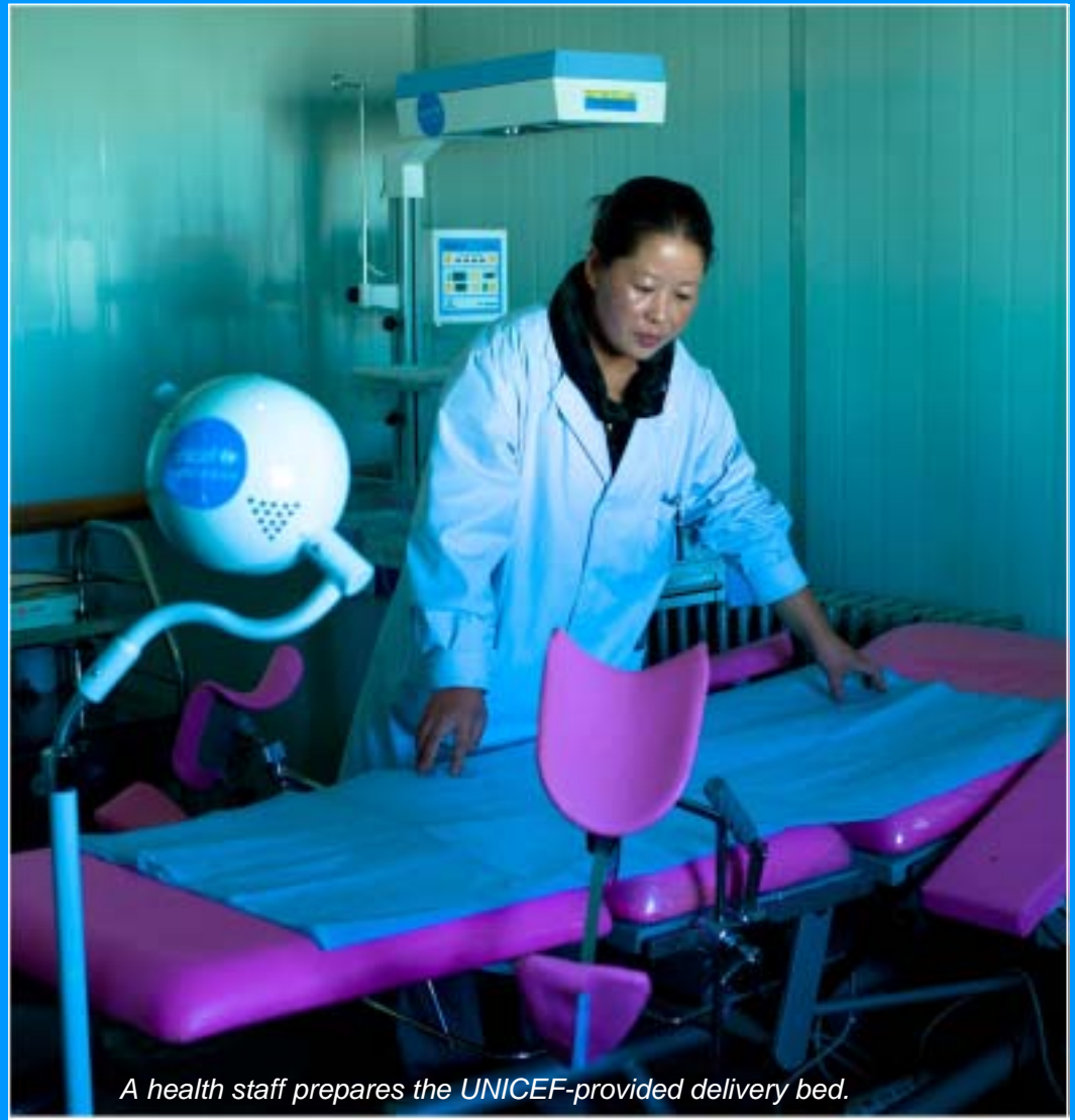
A health staff prepares the UNICEF-provided delivery bed.