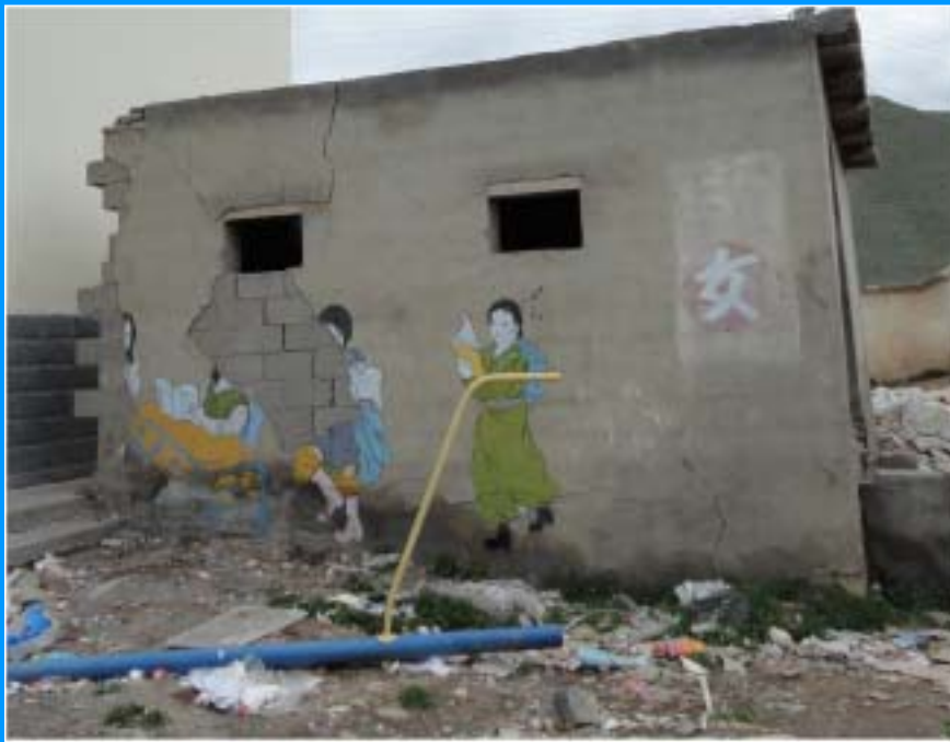
The earthquake damaged latrines in Yushu Prefecture (above), forcing children and women to use unsanitary latrines or practice open defecation (below). UNICEF is supporting the construction of sanitary latrines in 9 schools, benefiting 14,500 students.