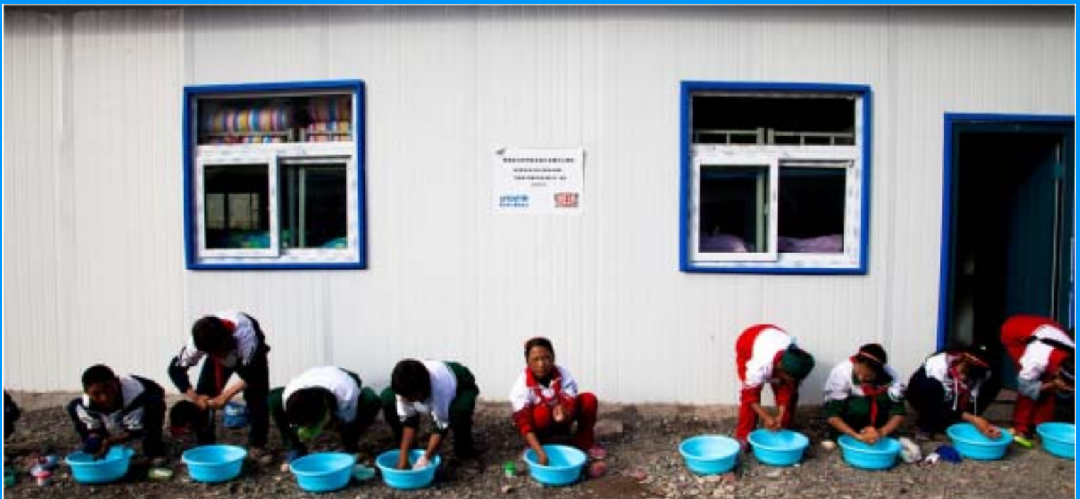
One year after the earthquake, washbasins and other supplies contained in the hygiene kits continue to be used by boarding school students in the earthquake zone (below).