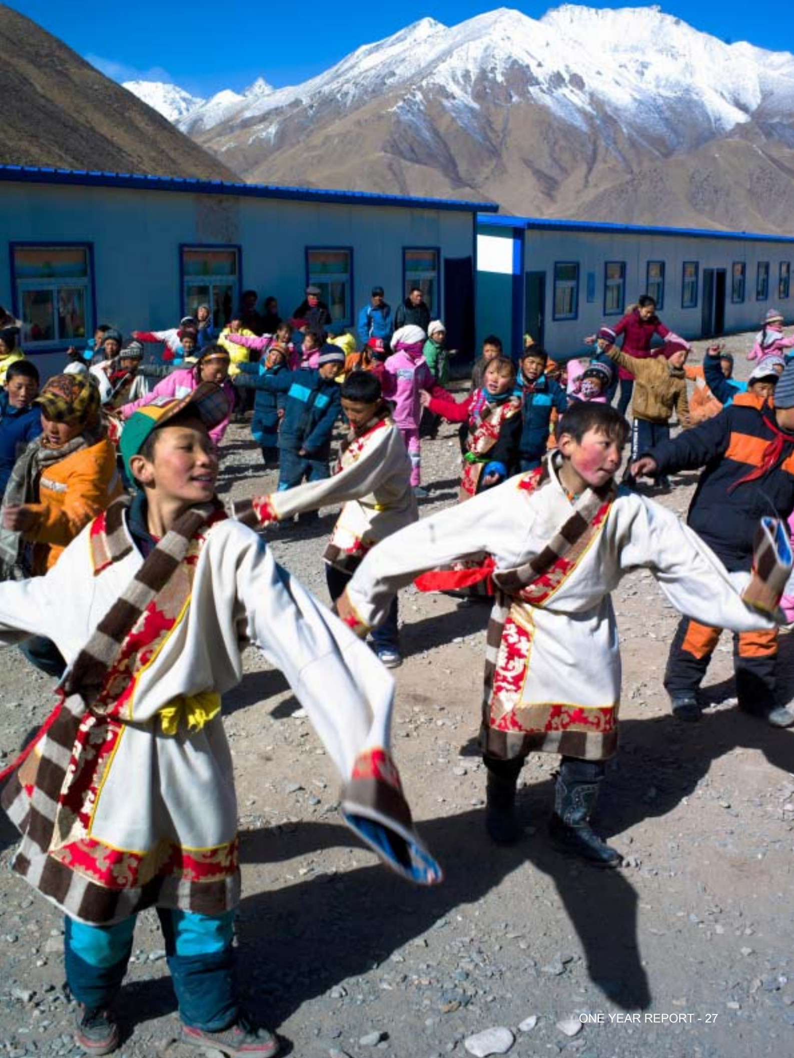
Students at Chengdu County's Gaduo Primary School perform their morning exercises in front of their UNICEF-provided prefabricated classrooms.