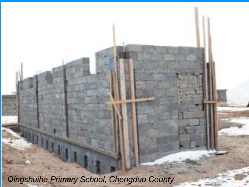
Qingshuihe Primary School, Chengduo County

UNICEF is supporting the construction of sanitary latrines in 9 schools in the earthquake zone. At some schools, such as at No. 3 Primary School, UNICEF supported the construction of temporary latrines, while at other schools, such as at Zhaduo Primary School, UNICEF supported the construction of permanent latrines. At Qingshuihe Primary School, construction is stalled because of extreme weather conditions, but is expected to be complete in the next few months.