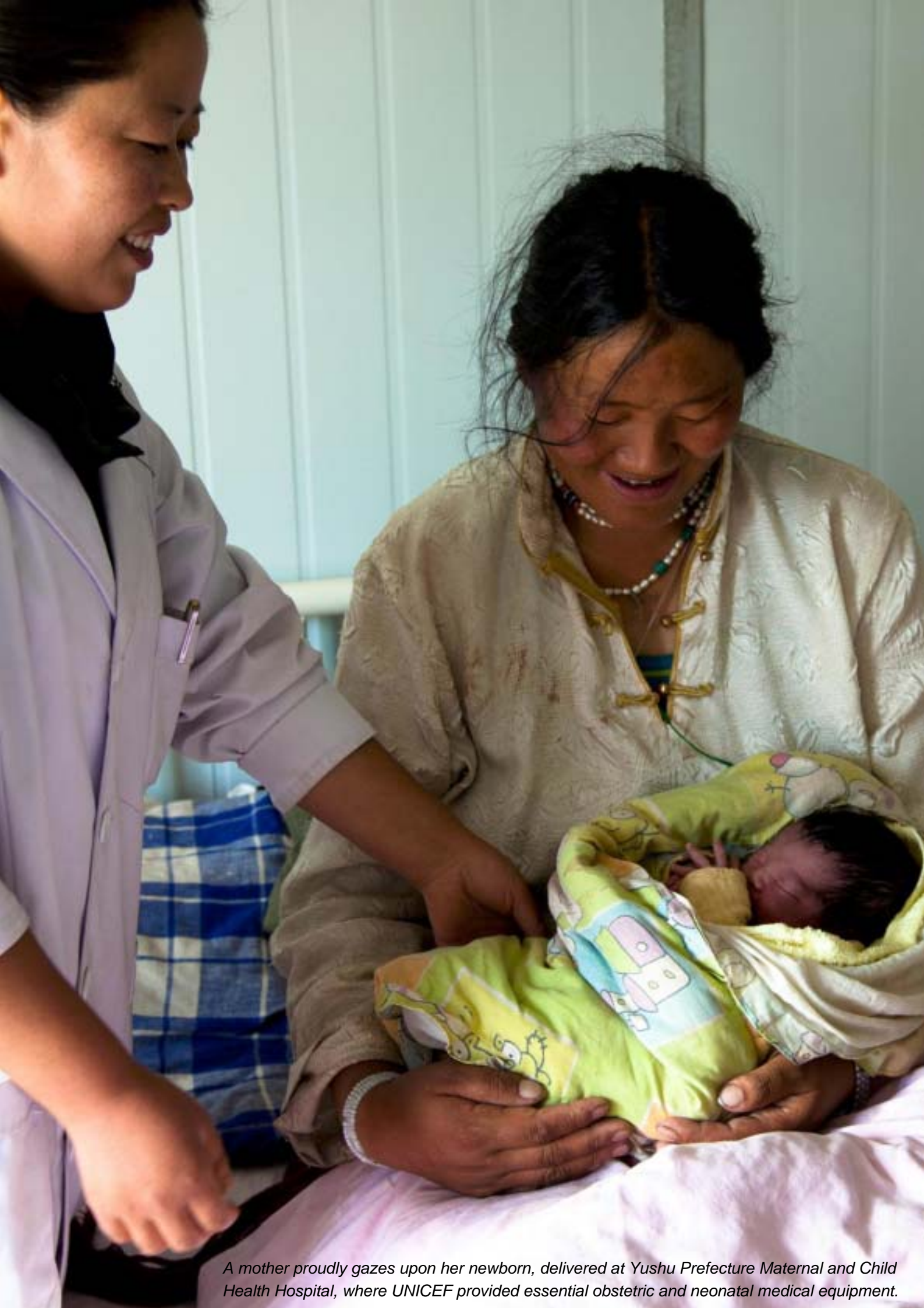
A mother proudly gazes upon her newborn, delivered at Yushu Prefecture Maternal and Child Health Hospital, where UNICEF provided essential obstetric and neonatal medical equipment.