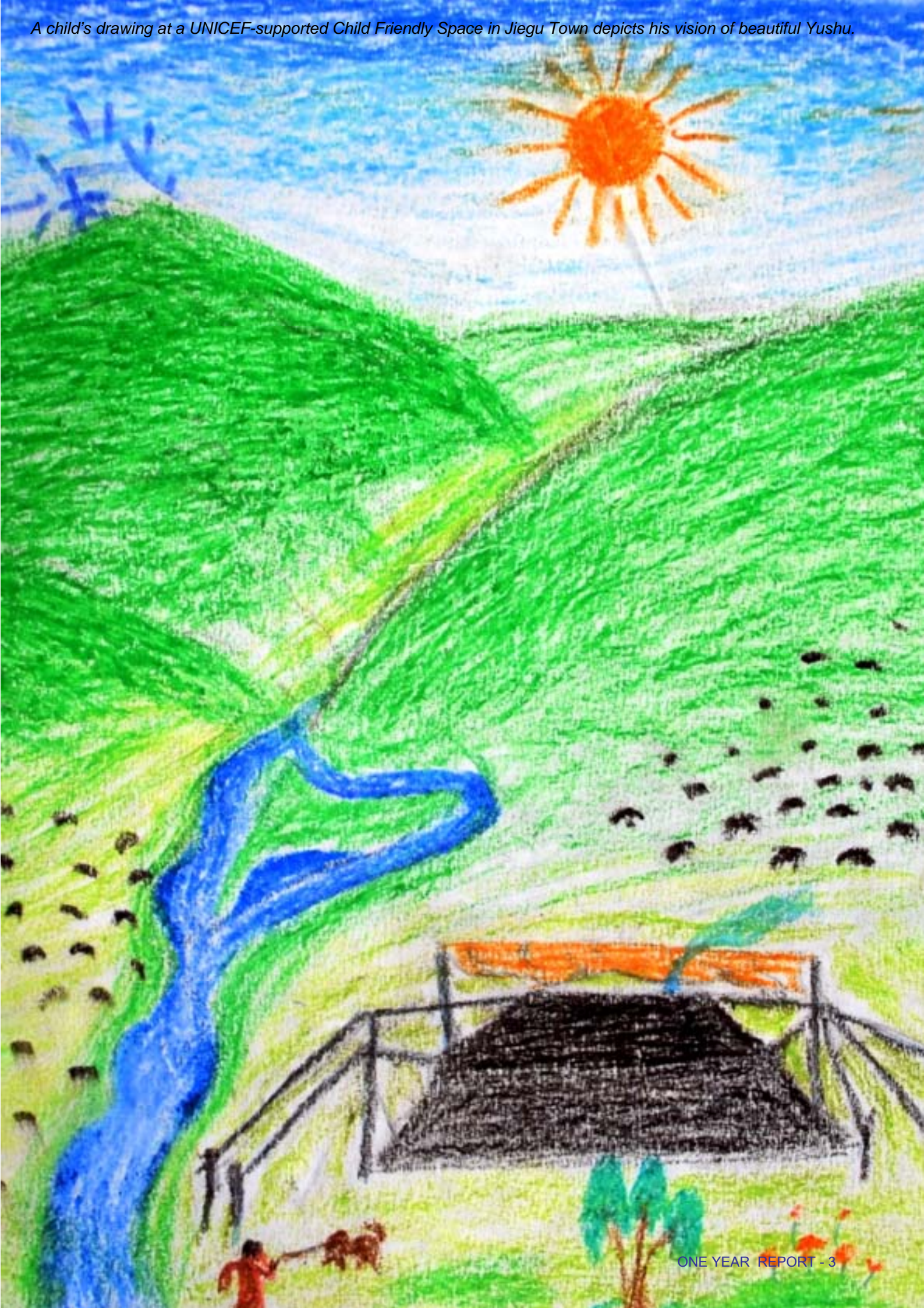
A child's drawing at a UNICEF-supported Child Friendly Space in Jiegu Town depicts his vision of beautiful Yushu.