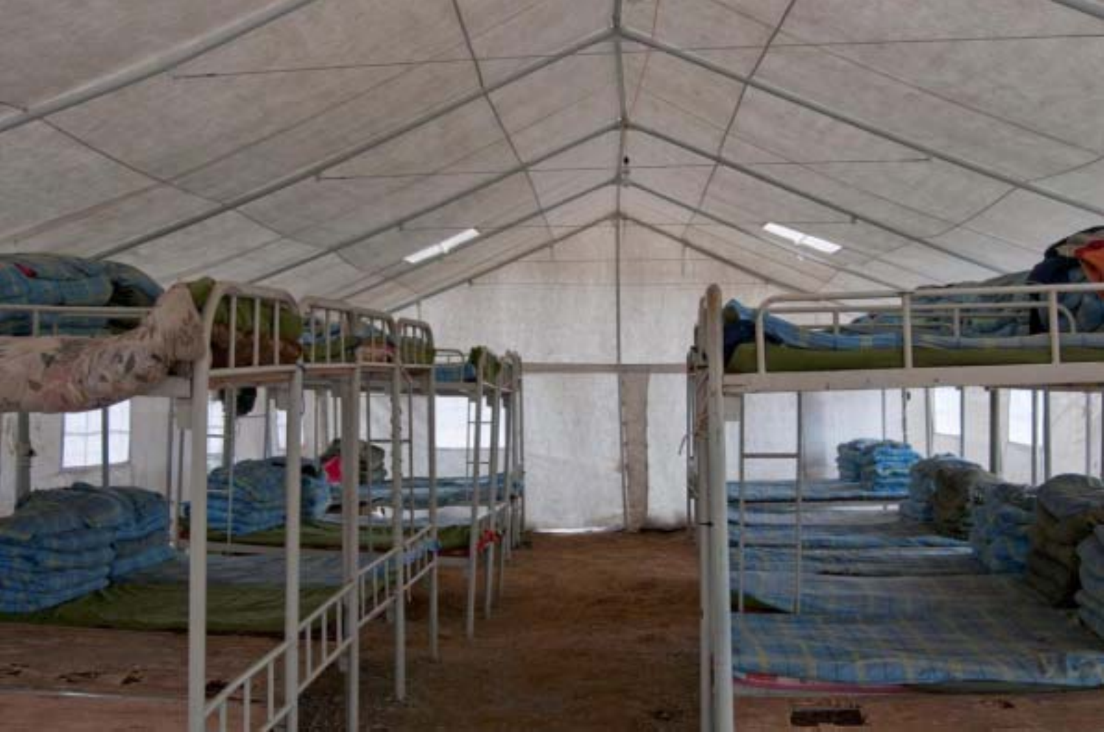
With the provision of UNICEF-supported prefabricated units at Chengwen Township Centre Boarding School and other schools in Chengduo County in August 2010, students were able to move from tents (above) into more sheltered spaces (below). For reasons of fire safety, however, the dorms are not heated, and students sleep under many layers of blankets.