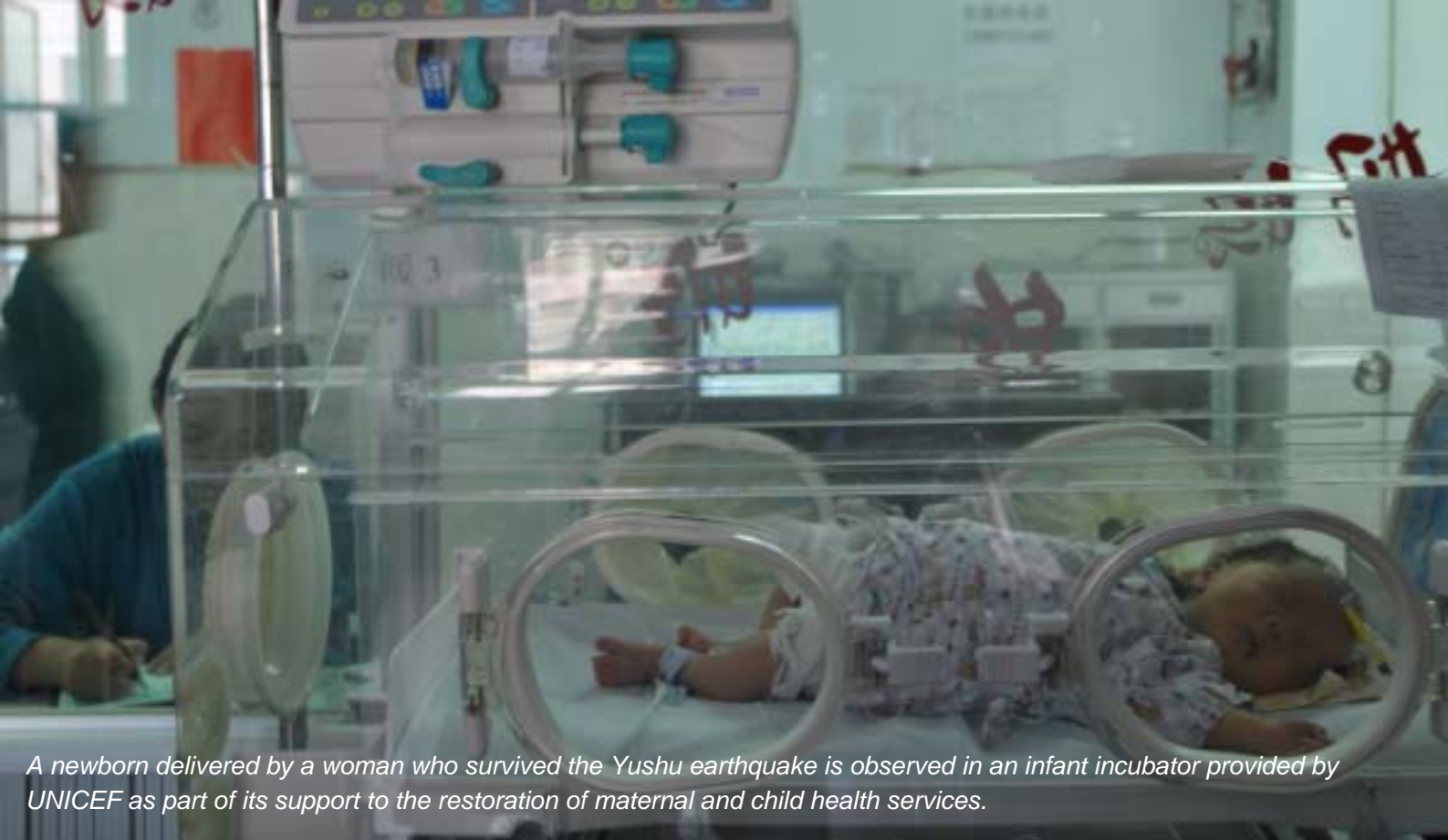
A newborn delivered by a woman who survived the Yushu earthquake is observed in an infant incubator provided by UNICEF as part of its support to the restoration of maternal and child health services.

In the year since the earthquake, routine MCH services have been recovered, with the County MCH Hospital providing prenatal care and routine gynaecological exams to 1,443 women and delivering 331 babies, and the Prefecture MCH Hospital delivering 267 babies. As reconstruction efforts proceed in the earthquake zone, both County and Prefecture Hospitals will move into permanent buildings in the coming months.