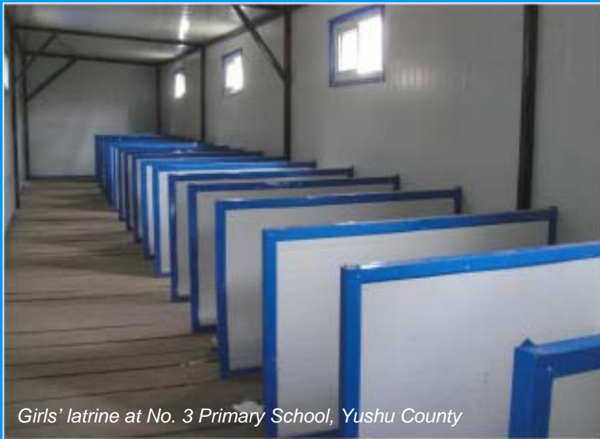
Girls' latrine at No. 3 Primary School, Yushu County