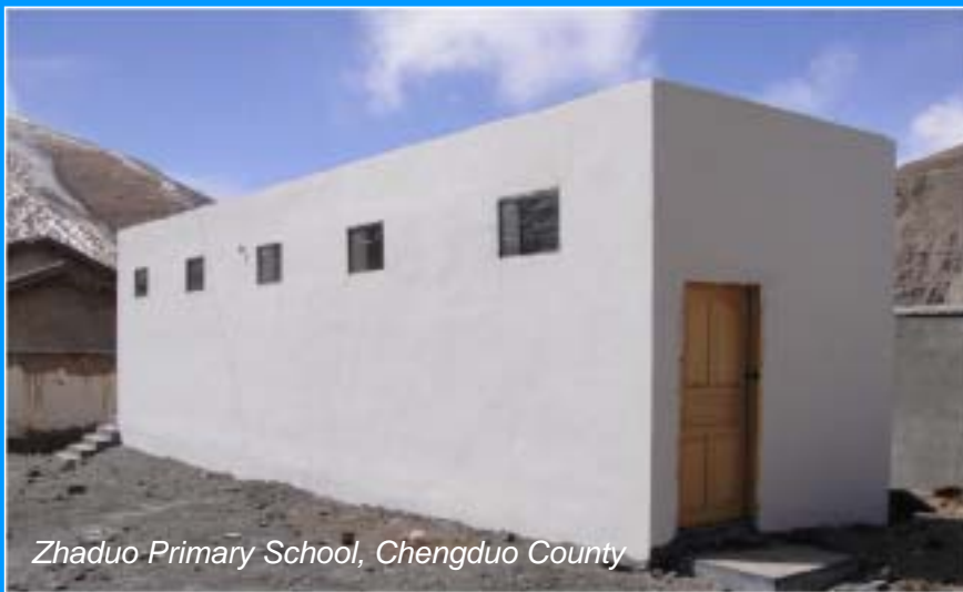
Zhaduo Primary School, Chengduo County