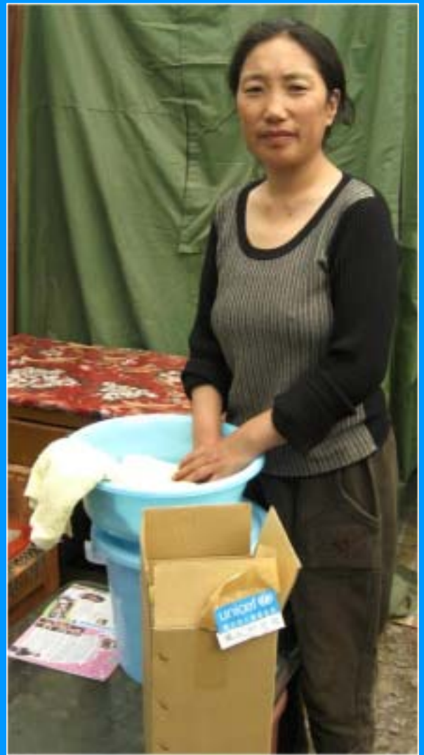
Hygiene kits provided by UNICEF in the aftermath of the earthquake played a critical role in helping the earthquake-affected population maintain personal hygiene (above).