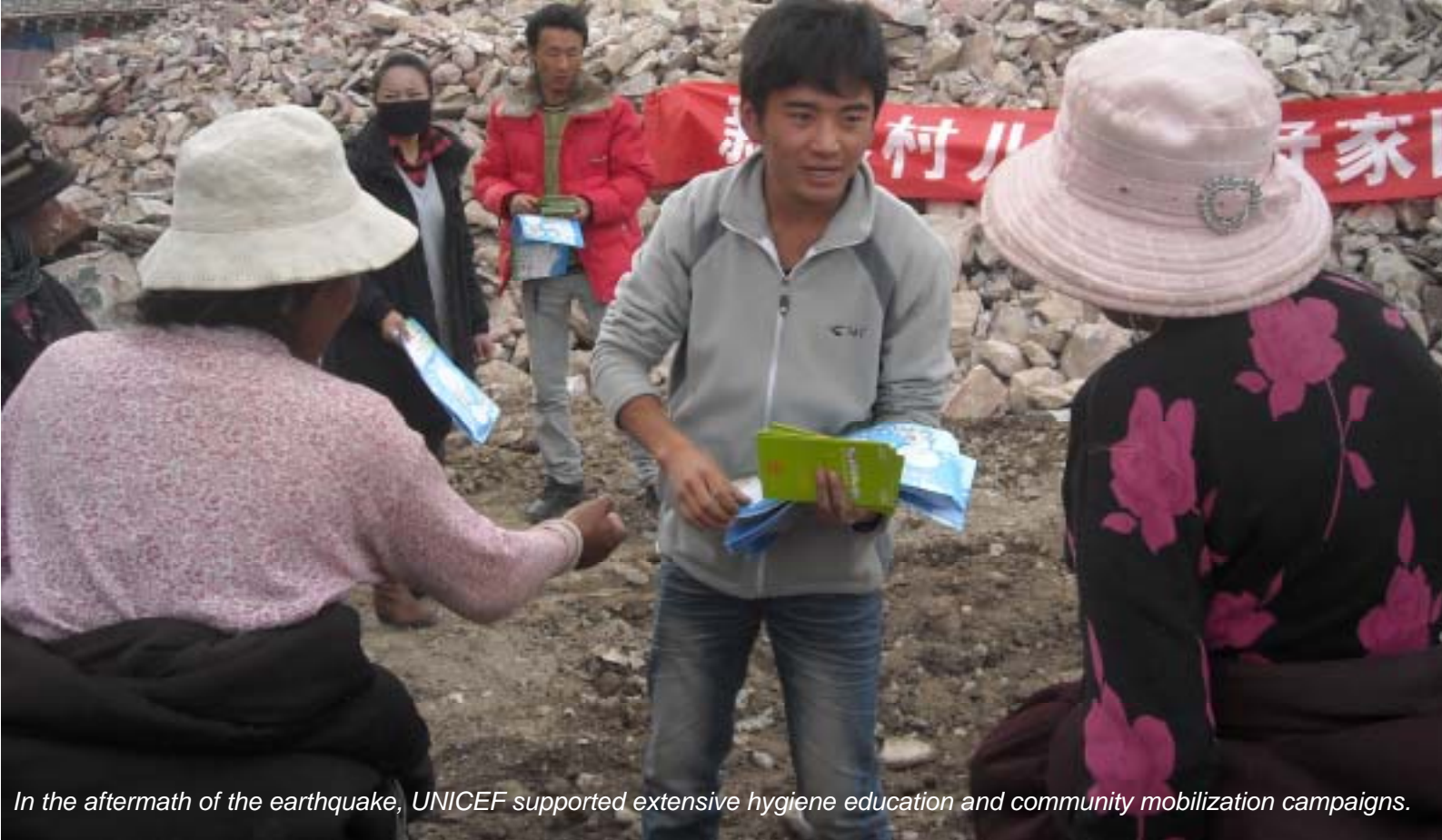
In the aftermath of the earthquake, UNICEF supported extensive hygiene education and community mobilization campaigns.

the only partner to inquire about the sanitation sector and offer support in this critical area.