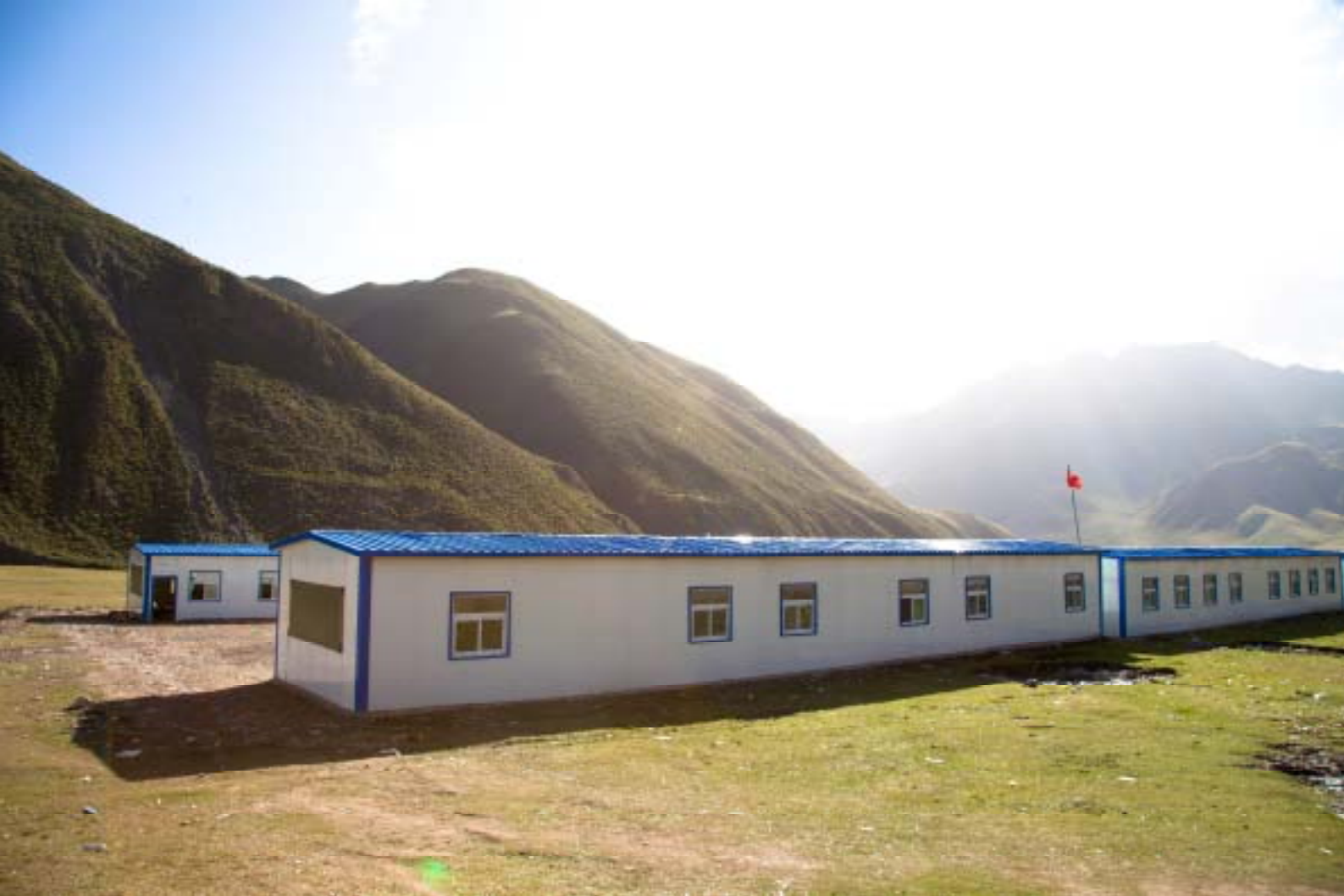
UNICEF-supported prefabricated classrooms in remote parts of the Yushu earthquake zone have played a critical role in returning children to school.